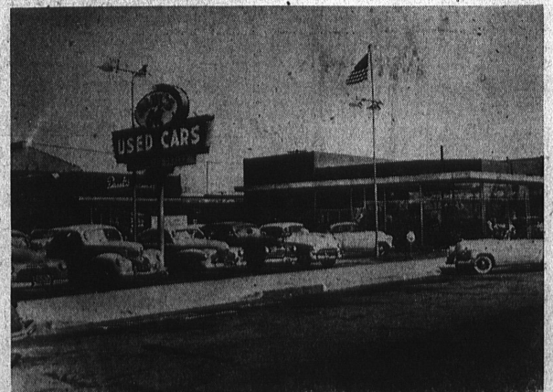
TODAY — The modern, spacious showroom which has been added to the let-age ser- vicing equipment at Paul's Chevrolet at 1640 Cabrillo is the center of interest as the parade of sparkling new Chevrolets pass through. In addition to the new cars, Paul's offers top-quality used car bargains at an adjacent lot and at another lot at 1961 Torrance Blvd. Paul's Chevrolet is also an official headlight and brake inspection station.