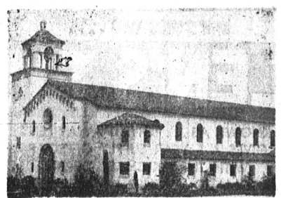
FIRST BAPTIST CHURCH AT CARSON AND MANUEL STS., TORRANCE