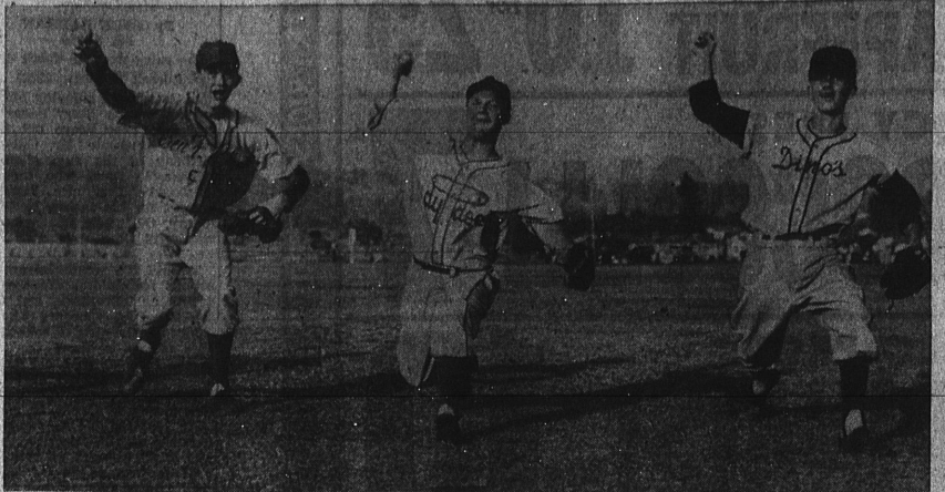
COMING AT YOU . . . Too old for Little Leagues and too young for American Legion baseball, these youths have found a home in the Babe Ruth League, formerly the Little Bigger League, a national baseball organization for boys 13-15 which Torrence will join this summer. Shown above are members of the All-Star team that played for the District Championship at Pasadena in 1953.