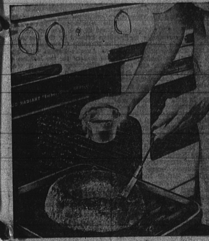
BEOLLED MEAT LOAF MADE EASY

wonder just exactly the way to broll a meat your favorite barbeeue sauce. Miss Maxine Howe, not me economist, will tell you it this way: It this way: It this way: It this way: It this way: It this way: It is way: It is way: It is way: It is way: It is way: It is way: It is way: It is way: It is way: It is way: It is ground beef It cup fine dry bread crumbs It is post way. It is auce It is p. salt It is p. salt It is p. pepper It onlor grade over the meat It is pround to doneness desired. INGREDIMNTS: It is dry bread crumbs It is p. salt It is p. salt It is p. pepper It onlor grade over the meat It is pround beef It is not dry bread crumbs It is p. salt It is p. salt It is p. salt It is p. salt It is p. salt It is p. salt It is p. salt It is p. salt It is p. salt It is p. salt It is p. salt It is p. salt It is p. salt It is p. salt It is p. salt It is p. salt It is p. salt It is p. salt It is p. salt It is p. salt