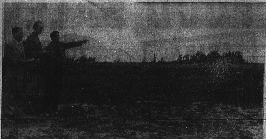
FAIR SITE STUDIED... Sponsors of the Community Fair to be held here in August study a proposed site north of Torrance Blvd. between Maple Ave. and Madrona. Looking over the