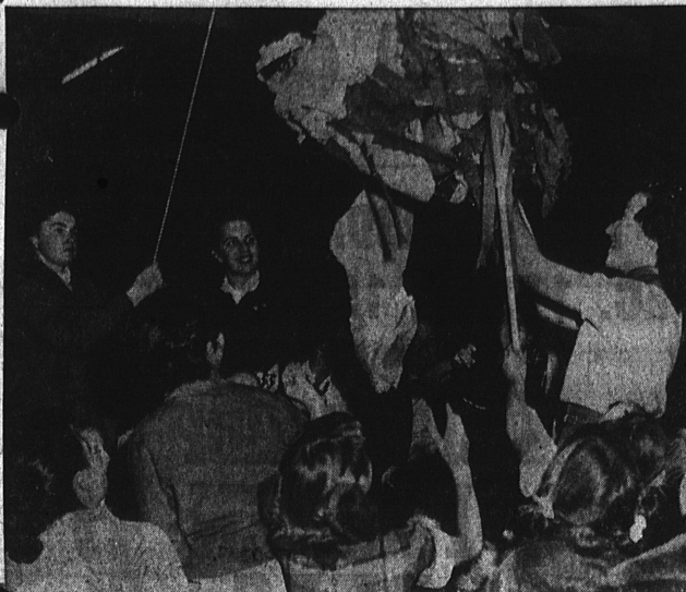
LOOK OUT BELOW!... Torrette Y-teens struggle to break open the pinata while hordes of children scurry below for the fruits and candies which will rain from the big red, green, and yellow bird. Breaking of the monster crepe paper fowl was the climax (for the children anyway) of Friday night's All Nations Christmas Family Festival, held at the YWCA.