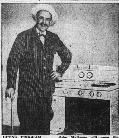
lionee will open the n at the Civic Audi-master of ceremonies.