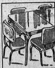
5-Pc. Chrome DINETTE SET 39 88

EASY TERMS Ultra modern 6-way lamp with plated base. 100-200-300 modul socket!