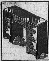
7-Drawer KNEEHOLE DESK 24 88

EASY TERMS Walnut or Mahogany finish; 7 roomy drawers! Fine construction; Rope edge.