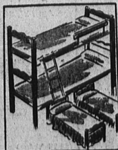
Sturdy... Metal BUNK BED SET 69 88

EASY TERMS Roomy table and 4 comfortable chairs. Plastic upholstered. Easy to clean.