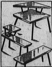
Fine Wrought Iron TABLES 19 88

EASY TERMS Makes into twin beds! complete with guard rail, ladder. Sturdy springs! Save!