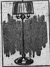
Practical 6-Way FLOOR LAMP 4 88

EASY TERMS Walnut or Mahogany finish; 7 roomy drawers! Fine construction; Rope edge.