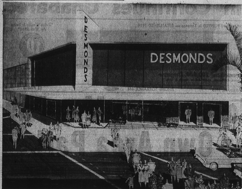
JOINS SHOPPING CENTER ... Latest addition to the ever-growing Crenshaw Center is Desmond's, one of California's

oldest and best-known retail organizations. The first Desmond's was established in 1882. The new Desmond's Crenshaw was opened at Crenshaw and Stocker this week-end.