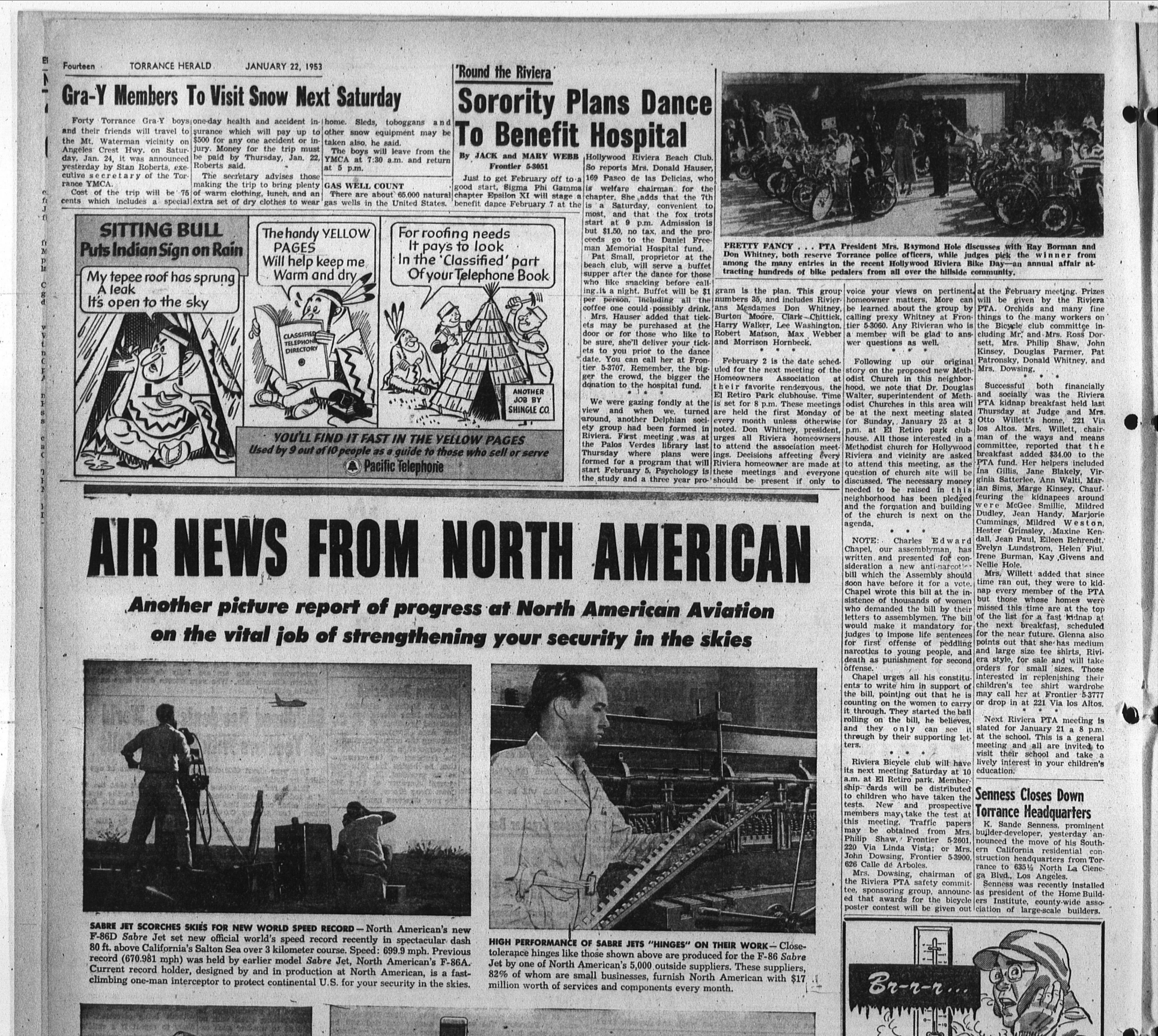
SABRE JET SCORCHES SKIE'S FOR NEW WORLD SPEED RECORD — North American's new F-86D Sabre Jet set new official world's speed record recently in spectacular dash 80 ft. above California's Salton Sea over 3 kilometer course. Speed: 699.9 mph. Previous record (670.981 mph) was held by earlier model Sabre Jet, North American's F-86A. Current record holder, designed by and in production at North American, is a fast-climbing one-man interceptor to protect continental U.S. for your security in the skies.