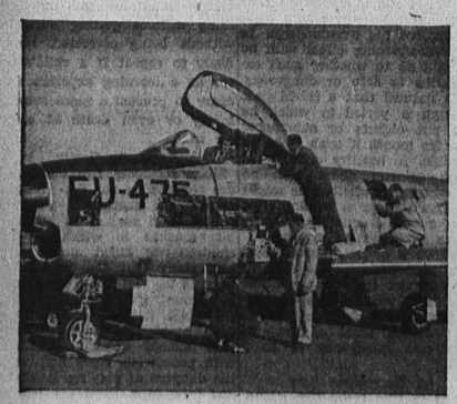
JOHNNY-ON-THE-SPOT TEAM—Modern fighting craft are so complex (165,000 fabricated parts) that it's almost impossible for one man to be an expert on every mechanism in the plane. So North American developed the idea of on-the-spot maintenance "teams" for military airfields throughout the world. Team members are specialists skilled in each phase of equipment in today's aircraft. Such men are typical of North American's high calibre employees.