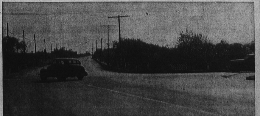
CORONER'S CORNER . . . This intersection, blind both ways to cars going east on East Rd., has been dubbed a death trap. Two fatalities have been recorded there in the past six months.

Six passengers in the ambulance (Continued on Page 2)