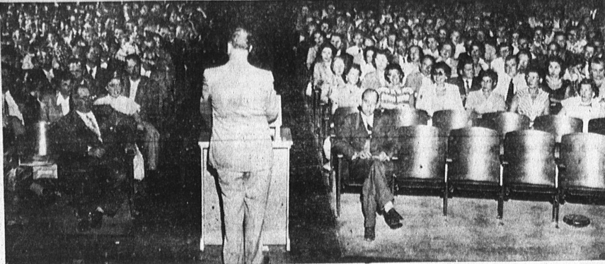
STARTS HERE . . . The fall school term started here last Monday as the teachers of the Torrance district gathered in the Torrance High School auditorium for a welcome and