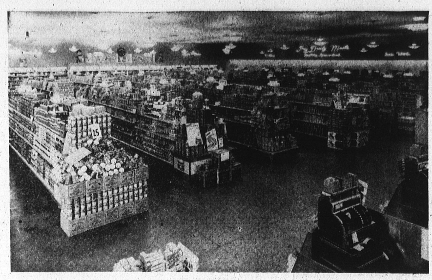
THE NEWEST AND LATEST IN MODERN SUPER MARKET GROCERY DEPARTMENTS IS SHOWN ABOVE IN THE NEW JIM DANDY MARKET—DISPLAYING OVER 4900 DIFFERENT ITEMS FROM APPLE SAUCE AND AMMONIA TO ZWIEBACK AND ZUCCINI.