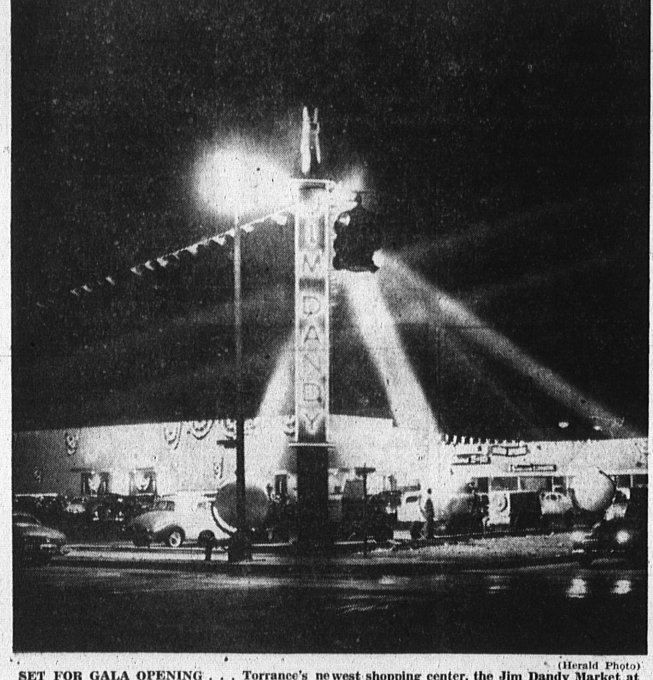
SET FOR GALA OPENING . . . Torran Torrance Blvd. and Crenshaw, is all set uled to open along with the market ar ce's newest shopping center, the Jim Dandy Market at t for an official Grand Opening this week-end. Sched-e Beacon Cleaners and Elkins 5 and 10-cent store. arket are