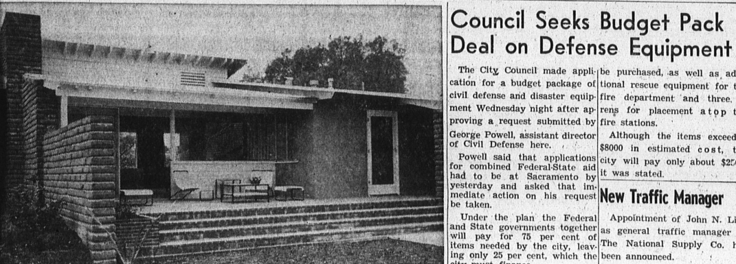
PATIO VIEW.... The Robinayre, the latest in architectural design in "contemporary-traditional," is now on display at Cinnamon Lane and Thyme Place, overlooking the Pacific in Portuguese Bend. Designed by Roscoe L. Wood, AIA, former Torrance architect, the building employs adobe and brick, and materials like translucent roofing and piano-hinged accordian doors. The home is open daily from 10 a.m. to 5 p.m.