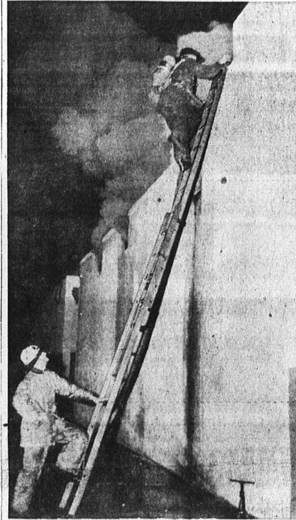
SMOKY . . . City fireman, wearing special oxygen equipment, climbs to the roof of the Quality Market during a pre-dawn fire yesterday. The market was severely damaged, and many cans of food destroyed by the blaze. The fire was listed as the city's worst in half a decade.

4. Nancy went next door with a bloody nose and called police. The boy friend had gone when officers arrived.