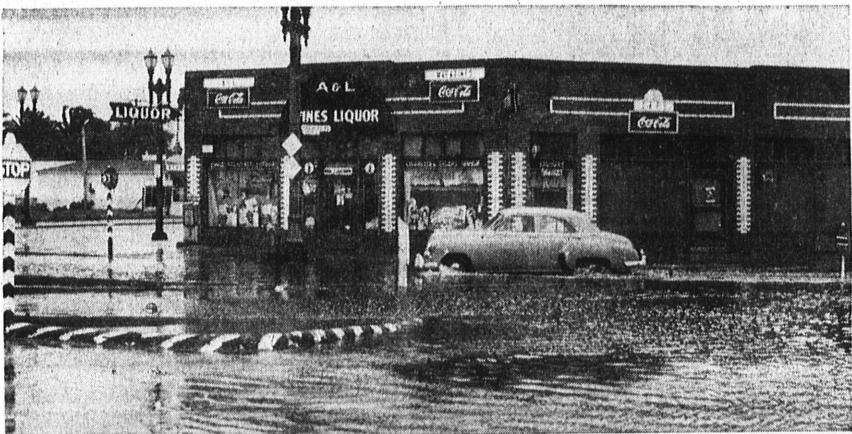
LAKE FIVE POINTS . . . A motorist braves the storm to coax his gas buggy across Cravens Ave. at Five Points during height of Saturday's rain. The water flowed up over

and boots. Last weekend's rain flooded her back yard and considerable other areas in west Torrance.