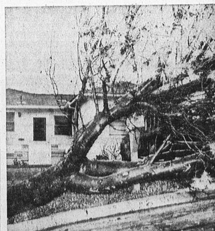
FIRST TO FALL . . . This giant tree might have won the purple heart with pine cone clusters, if such awards were given to the woody specimen, for it was the first to fall in week-end storms. Road crews were called in to free the driveway so hubby could get to work. It fell lat 262nd St. and Alta Vista Ave.