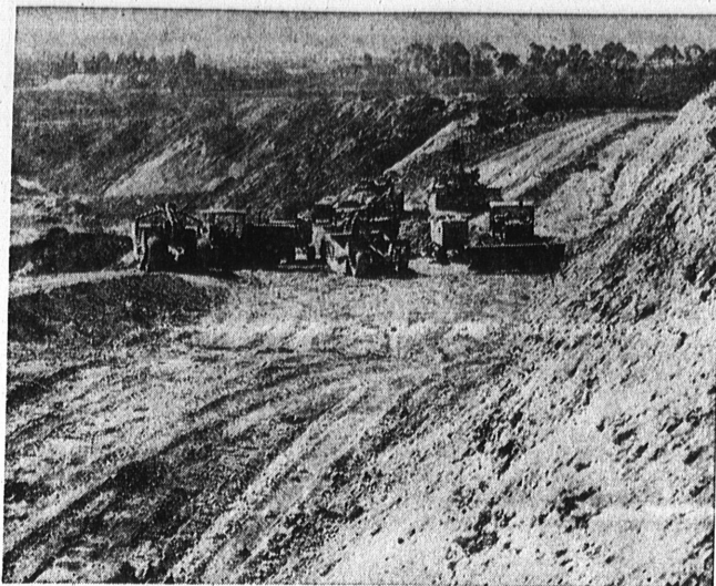
OLD MEETS THE NEW... County construction equipment is shown on the rough roadbed of new Crenshaw Blvd., only a short distance from the joining point with the old highway, just south of Pacific Coast Hwy., at the Torrance-County boundary line. When completed, Crenshaw will be a Los Angeles to the ocean highway, traversing the heart of the area here.