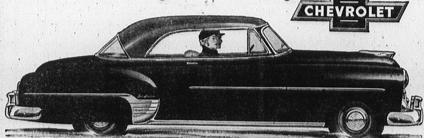
LOWEST PRICED IN ITS FIELD This big, beautiful Chevrolet Bel Air—like so many other Chevrolet body types—lists for less than any comparable model in its field!

(Continuation of standard equipment and trim illustrated is dependent on availability of material.)