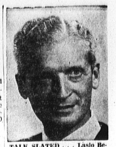
TAIR SLATED . . . Laslo Benedek, director of the motion picture version of "Death of a Salesman," will speak at El Camino College next Tuesday evening. Residents have been invited to attend the director's talk in Room 8 of the administration building. He will discuss the sociological values of the "Salesman."

The 46th annual Illinois Lincoln-Day picnic will be held in Bixby Park, Long Beach, Saturday. Program will start at 1 p.m.