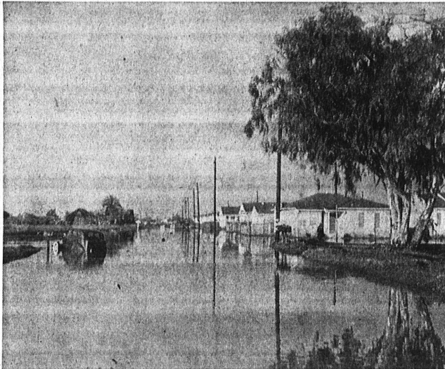
NO GONDOLAS . . . This strip of 166th street in North Torrance has all the trimmings for a canal city except the singing gondoliers. There was easily enough water to float a gondola—too much for the auto marooned at the intersection.

to emergency stations set up by the Red Cross.