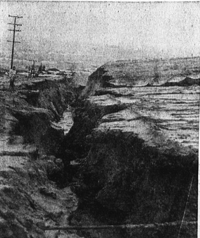
RIVIERA CANYON . . . Size of this canyon cut into hillside in the Hollywood Riviera district may be judged by comparing it to figure of man standing on its rim (in front of phone pole). The water racing through the soft sand threatened several homes below the hill.