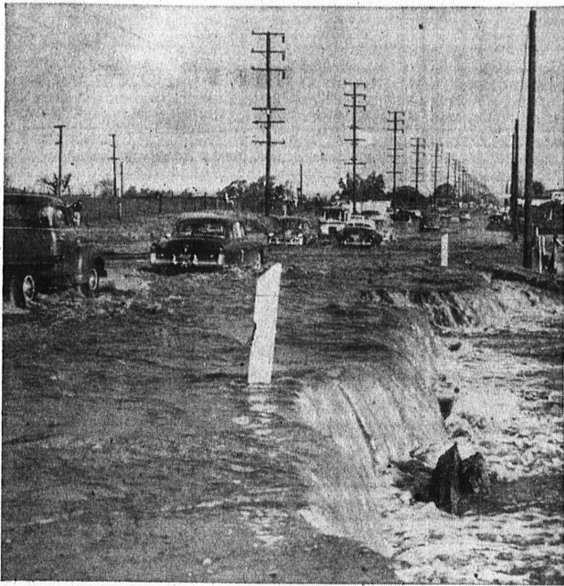
TEMPTING FATE . . . Motorists disregarded "Road Closed" signs posted on Western avenue Friday morning to ford the fast-flowing Dominguez Creek as it went across the street near 174th street. Shoulders of the road were considerably damaged by the water.