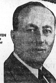
DR. COWEN Credit Dentist

NOW IS THE TIME TO ACT! Take advantage of Dr. Cowen's Savings! Come in and see the samples—judge for yourself how much you actually SAVE on modern dentures that are scientifically designed to help bring you YOUTHFUL NATURAL APPEARANCE, IMPROVED COMFORT and HEALTHFUL CHEWING POWER. Ask your Dentist about the improvements in the new Transparent Material Plates set with Trubyte Bionorm Teeth.