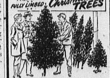
Help Your Y. W. C. A. Buy Your Tree at Their Big Lot Next to the Stadium Theatre