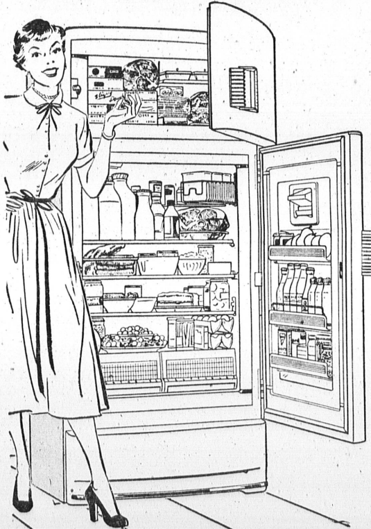
MODEL EG-106-4, $509.95

Speed Freezer Holds 24 Pounds! New Adjustable Freezer Cold Control!