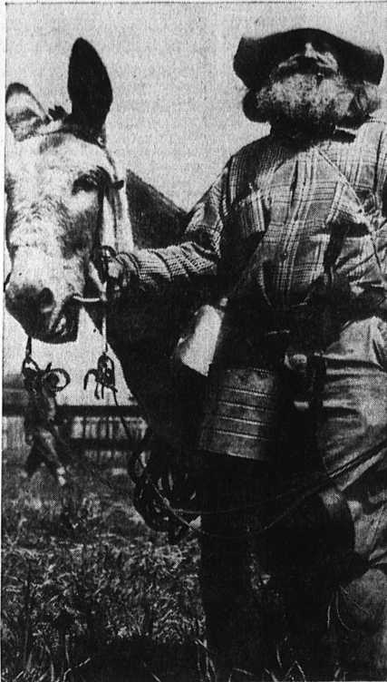
THE OLD TIMER ...Reputed to be California's oldest Rough Rider, the Old Timer will be at the Greater Torrance Market with his trick burro Saturday afternoon from 1 until 5 to kick off the White King Soap Company's $90,000 contest. He may even let the kiddies ride the burro, he hinted this week.