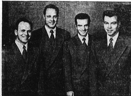
THE KING'S HERALDS . . . To Be Heard Sunday