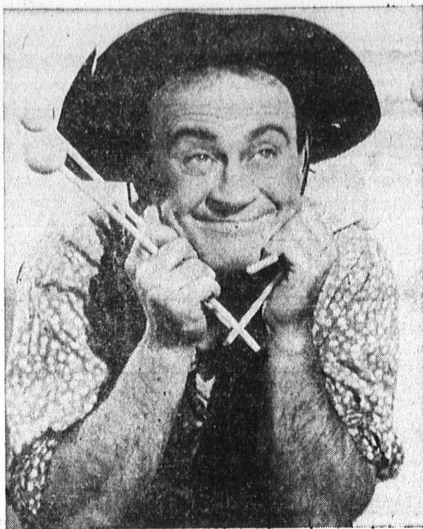
CANNONBALL DUE ... Signed up for the 14th Annual Police Show to be staged here November 10 is Dub Taylor, the Cannonball of Monogram Pictures. He is rated high on his xylophone and is ready to thrill those attending the show.