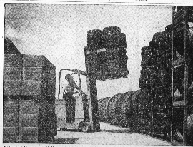
We're stretching our available supply of metals and other critical materials by every means science can devise.

Personal typing, the use of the dictaphone, and a few other simple business machines are taught.