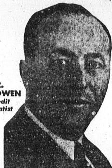
DR. COWEN Credit Dentist

NOW IS THE TIME TO ACT! Take advantage of Dr. Cowen's Savings! Come in and see the samples—judge for yourself how much you actually SAVE on modern dentures that are scientifically designed to help bring you YOUTHFUL, NATURAL APPEARANCE, IMPROVED COMFORT and HEALTHFUL CHEWING POWER. Ask your Dentist about the improvements in the new Transparent Material Plates set with Trubyte Bioform Teeth.