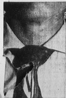
DIAGRAM "B" ... And After