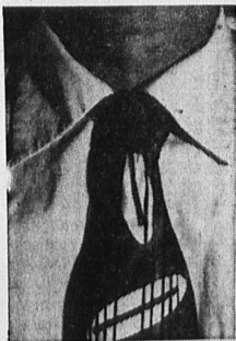
DIAGRAM "A" ... Before