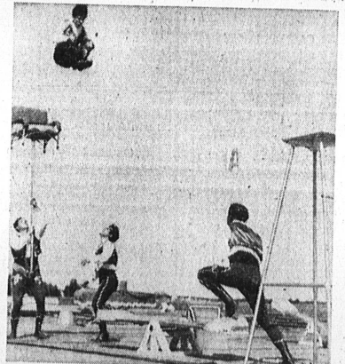
UPS-A-DAISY ... One of the famous Pina Troupe is getting ready to sit down the hard way. Flipped from the teeterboard, he will land comfortably in the chair held aloft by another member of the troupe. The acrobats have been signed to appear here in the 14th Annual Police Show, it was announced this week.

Proceeds from the annual show is turned over to the Torrance Police Officers' Association which uses the funds to support the activities of the TAP, the Torrance Auxiliary Police. The TAP is made up of young Torrance boys and girls.