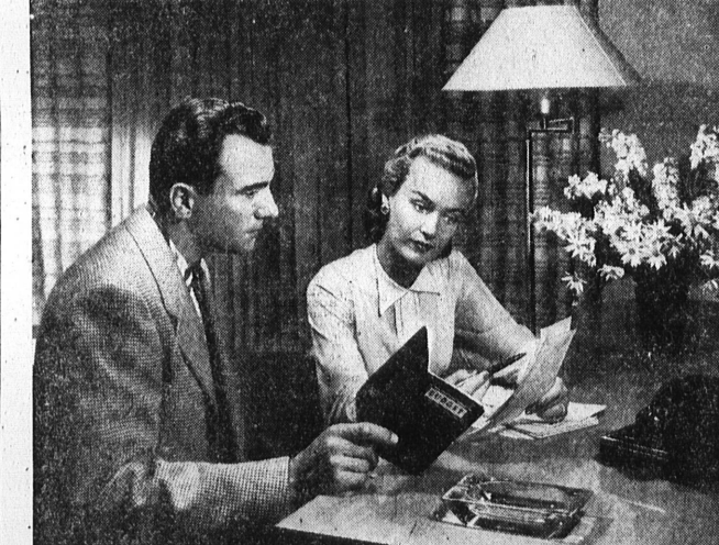
In spite of today's inflated prices, your telephone remains one of the lowest-cost items in the family budget.