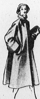
They Are Here!

Skirts . . . $3.98 Blouses . . . $2.98 Sweaters . . . $4.98 Shorties . . . $24.90