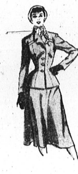
Shirley Created NEW SUITS

For the young set . . . and the set who still like their styles young . . . you'll be delighted with these.