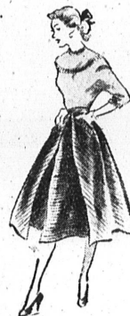
New for COLLEGE

Skirts . . . $3.98 Blouses . . . $2.98 Sweaters . . . $4.98 Shorties . . . $24.90