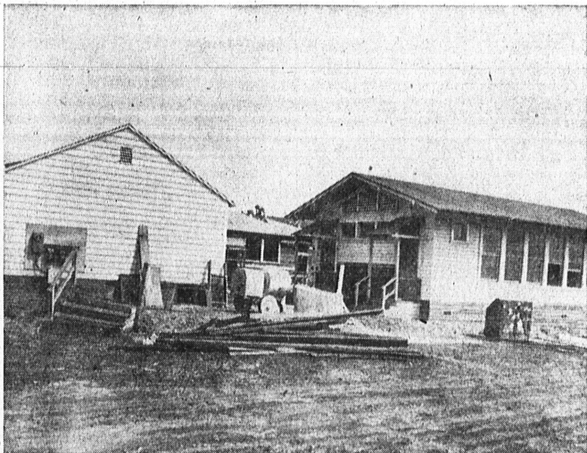
CRENSHAW ELEMENTARY . . . Workmen are rushing to get the temporary cottages at the Crenshaw school ready for the first day of school, September 17. The new elementary school is located on Crenshaw boulevard just north of 190th street.

The Madrona and Riviera schools will not be ready until spring, according to the best estimates.