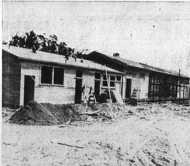
EL NIDO ELEMENTARY . . . Temporary buildings for the new El Nido Elementary School just west of Hawthorne boulevard at 186th street are being rushed for the opening of school September 17. Considerable repair was required on the buildings. (Herald photo).