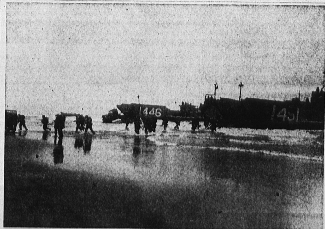
BEACH PARTY... While peace talks between the Reds and the Allies continue, these Torrance boys from the 578th Combat Engineers, Company A, practice an amphibious landing at Chigasaki Beach near Yokohama, Japan. The local company is part of the 160th Regimental Combat team and was stationed at Camp Haugen, near Hachinohe, prior to the exercises. After the landing of personnel and heavy equipment the company left for Camp McNair on the slopes of Mt. Fuji in Central Honshu for further field training.