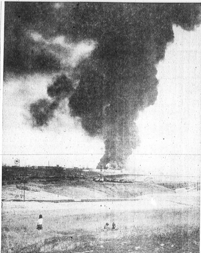
WHERE THERE'S SMOKE... There's fire, and plenty there was for four days last week at the Union Oil Refinery in Wilmington. Visible from all sections of Torrance was the huge column of black smoke which started pouring into the skies at 1:57 p.m. on July 12 and continued until 4:42 a.m. four days later.

Torrance Men's Shop Home of Nationally Advertised Merchandise 1325 SARTORI TORRANCE