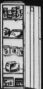
UTILITY CABINET 66" high by 18" wide by 12" deep. 5 shelves for lots of storage space ..... $16 95

NOW...MODERNIZE YOUR KITCHEN WITH STOR-ALL KITCHEN CABINETS