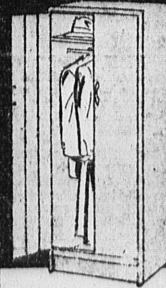
WARDROBE Big and roomy. Hang- ing rod and hat shelf. 63" high by 24" wide by 20" deep ..... $20 95