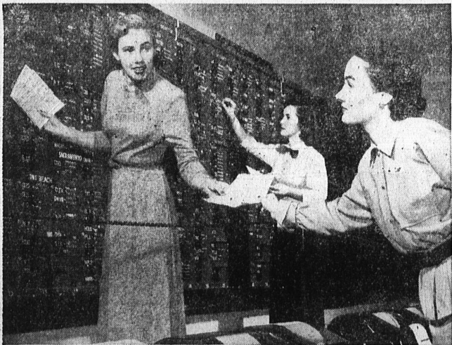
Re-routing Long Distance circuits—one of the many interesting, vital jobs for women in the telephone business.