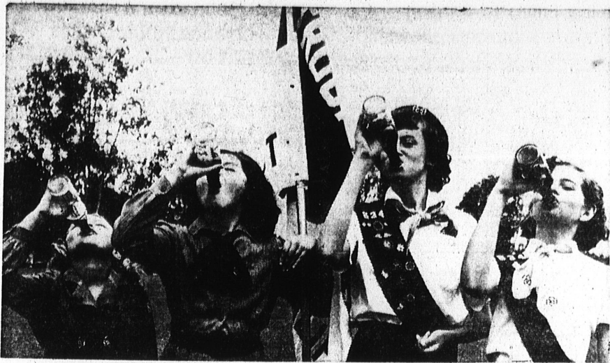
SCOUTS ATTEND BIRTHDAY PARTY . . . Sixty-seven troops of Girl Scouts in the Harbor Area were represented at the Juliette Low Ingathering held recently in Peck's Park. It is estimated there were about 1000 girls and adults present and the contributions to the world fellowship fund were about $200. Torrance district exemplified international friend-