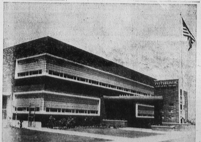
IT'S OFFICIAL ... Dedication ceremonies next Wednesday will mark the official transfer of the Pittsburgh Paint and Plate Glass Company's operation from Los Angeles to its new Torrance plant shown above. (Herald photo).