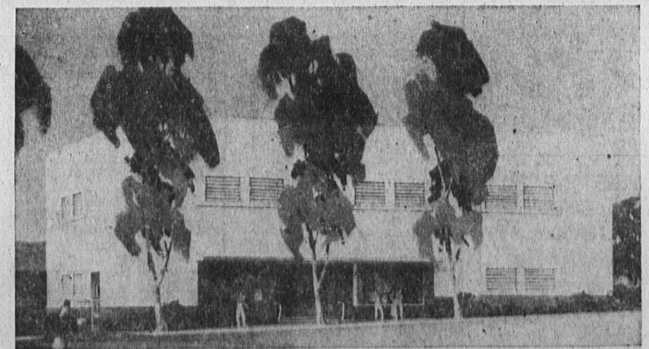
TWO-STORY DIAL HOUSE . . . Nerve center of Torrance exchange dial telephone system will be housed in a new $650,000 project for which ground will be broken within 11 days.

The pair, free on $500 bail each, are due for a preliminary hearing at 2 p.m. this afternoon before City Judge Otto B. Wil-