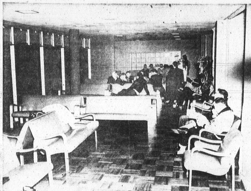
WARRIOR LOUNGE . . . Students at El Camino College can take advantage of the facilities of this new lounge in the Campus Center to study and wait between classes. The new