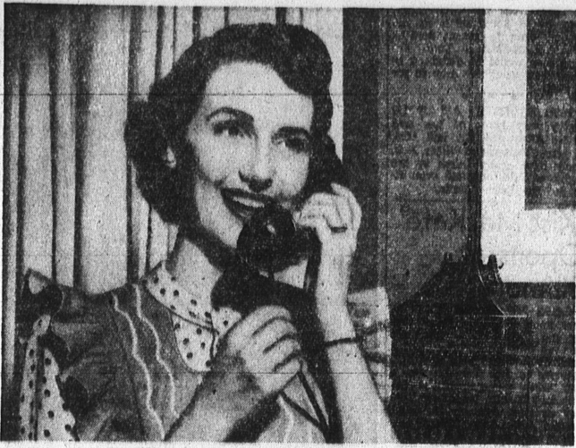
A mighty good friend of the family budget, your telephone offers more service than ever—at bargain rates.