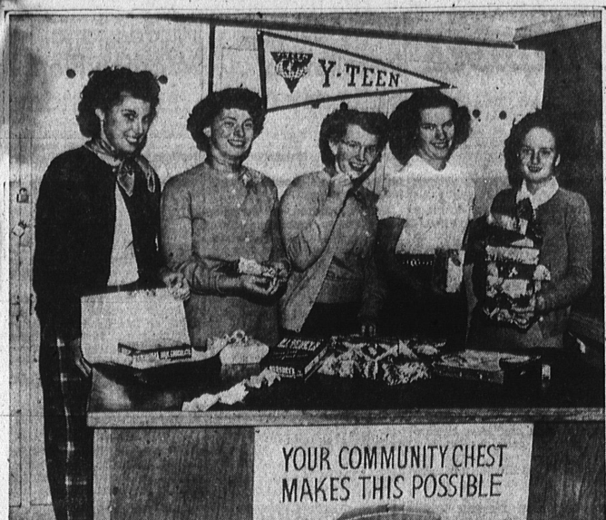
YOUR COMMUNITY CHEST MAKES THIS POSSIBLE