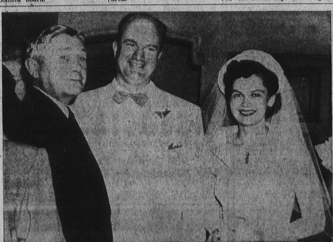
See Story Page 11