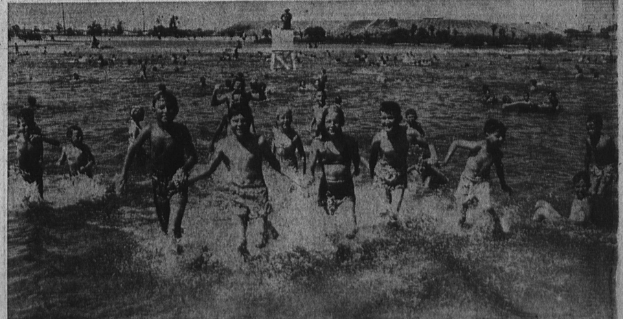
Additional Photos Page 4

new pool hosted more than 5000 heat-the-heat water-frolick ers the first week it was open. (Herald photo).