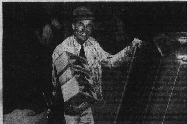
The new telephones put in daily mean more value for all. You can reach more people... more can reach you.