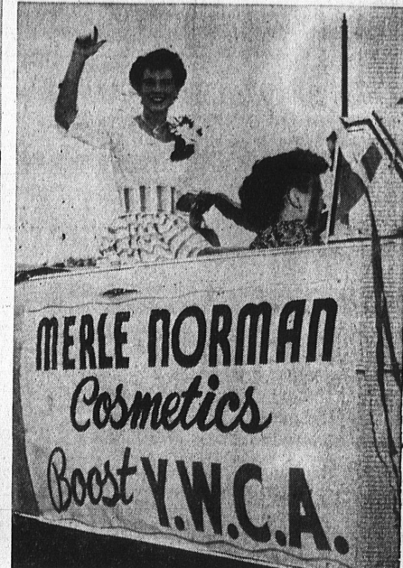
Watch Jackle Pop Up, She's No. 2 Now