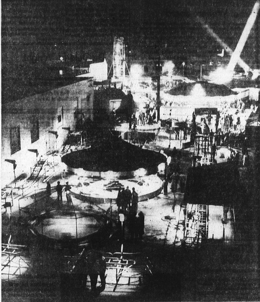
THE GLAMOUR OF BRIGHT LIGHTS . . . Attracting people like moths to a flame, the searchlights, neon and hurly gury of the music weaves a spell of temporary magic over what were only some parking lots a few days ago. But while the Lions-Optimists Clubs' Fun Festival lasts—through