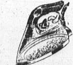
Two-Way Steam Iron