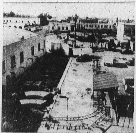
... STEP BY STEP. AT THE UPPER RIGHT