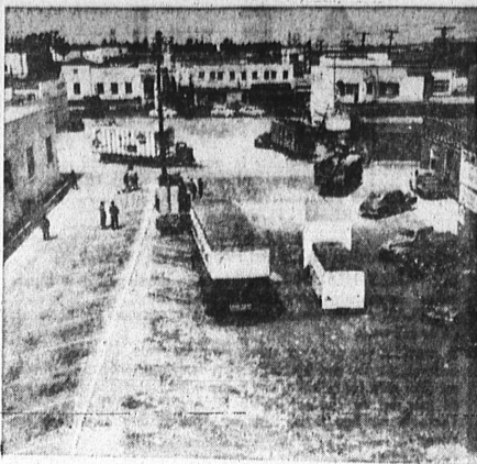
THIS IS HOW A CARNIVAL IS BORN