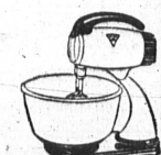
Automatic Mixer With Bowls