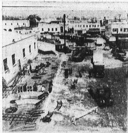
THEN THE UNLOADING—AND THE SET UP.