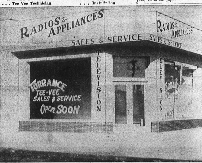
NEWCOMER . . . Pictured is the new sales room and service room of the Torrance TEL VEE store which will hold a grand opening Friday. The store, located at 1629 Cravens avenue, will feature nationally-known names in television, radio and other major home appli-

To Be Given Away to Some Visitor Without Cost or Obligation