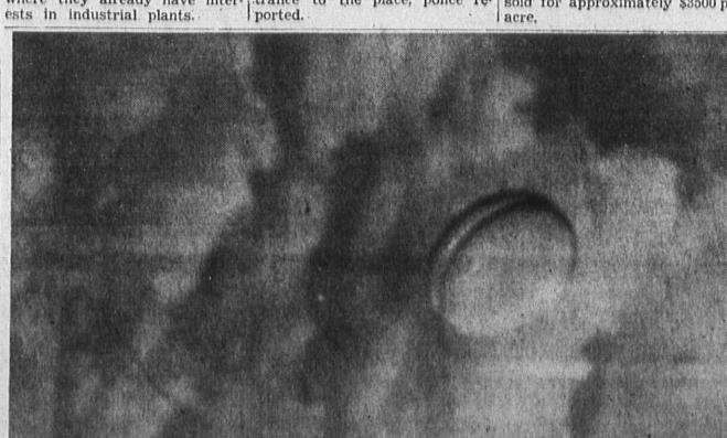
A FLYING DISC?

Somewhere, somebody has a brown and white Collie pup about 18 inches high that belongs to a girl in a hospital, who has not long to live. There will be no questions—only "Thank You" for anyone who returns the pup to 24461 Madison street in Walteria.